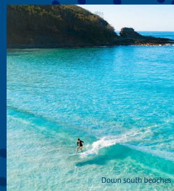
Down south beaches